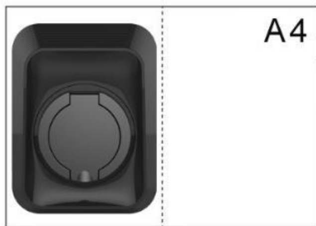
Only half of A4 Paper