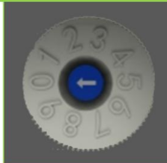
Current is adjustable via DIP Switch at 10 Gears